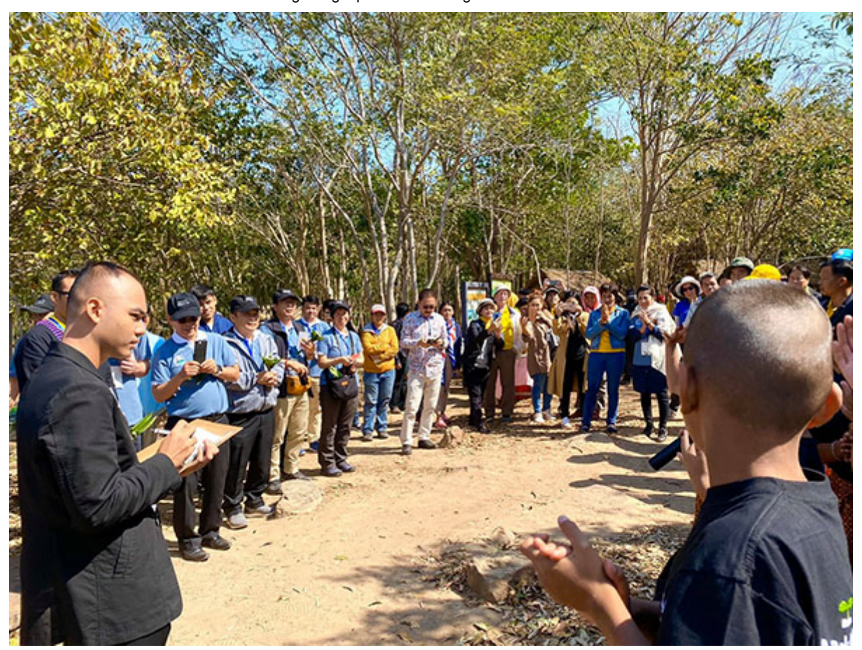
The participants during the field trip