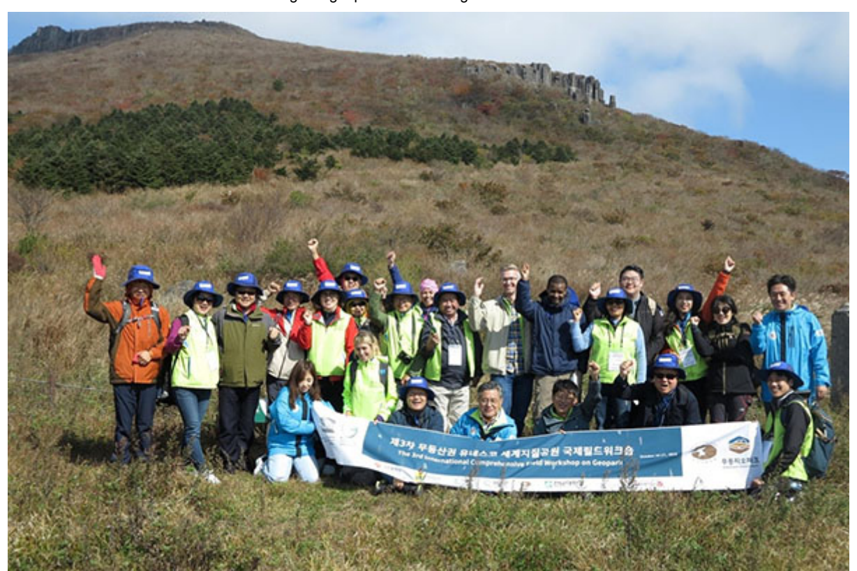
Participants of the workshop during field trip