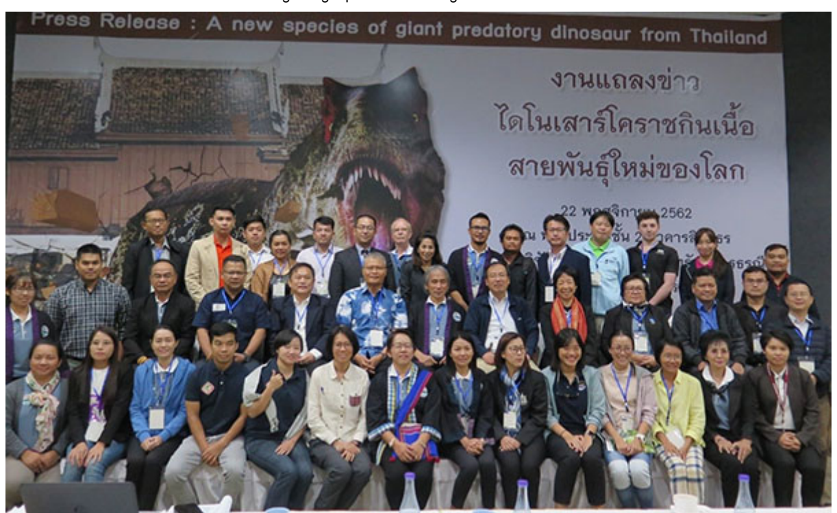
Group photo of the conference participants

Since 2016, the JGN has been engaging in the project of capacity development for countries with no Geoparks, or only a limited number of Geoparks, in the Asia-Pacific region. At the beginning of this project, the JGN invited participants from several countries in Asia-Pacific to observe the activities of geoparks in Japan and also provided opportunities for participants to communicate with people involved in geoparks.