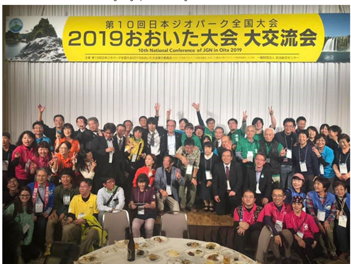
Group photo of the conference participants