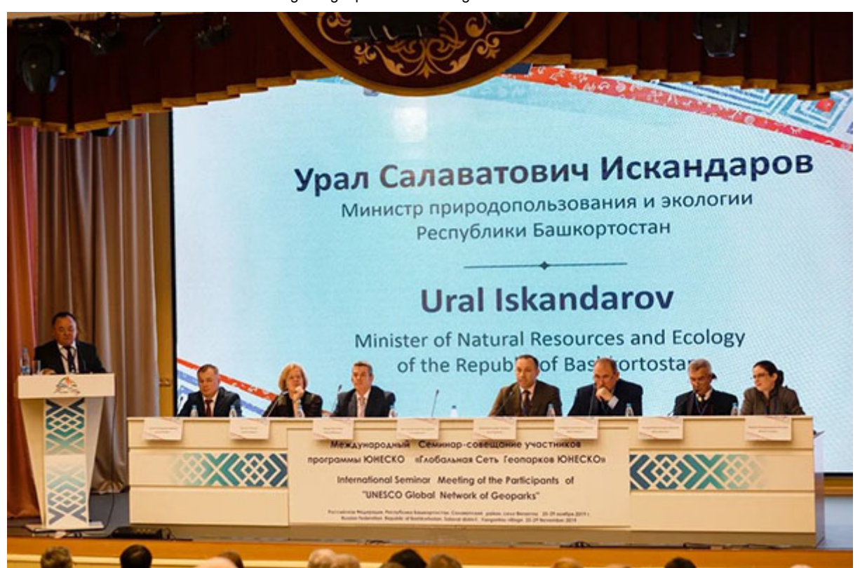
The panel of the International Seminar