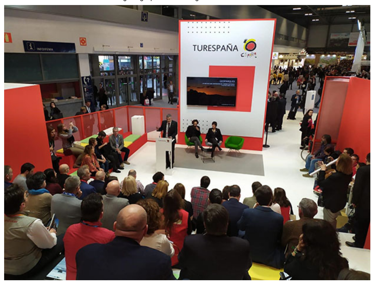
Geopark presentation event in TourEspana pavilion at FITUR 2020