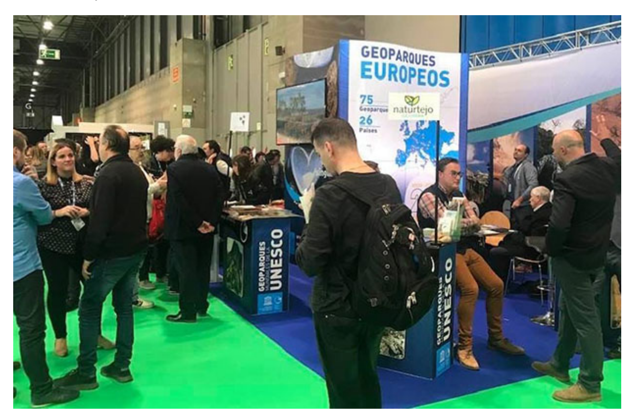
The Geopark stand was very busy during all the days of FITUR

The Geopark Stand was located at the Pavilion 4 – EUROPE, emphasizing the role of the UNESCO Global Geoparks as sustainable tourism destinations in 25 European Countries.